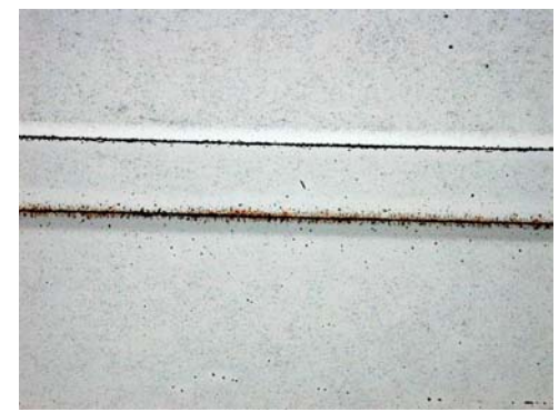
Figure 1. Red rust on tension bends of prepainted HDG.

As the corrosion progresses, the zinc underneath the paint is consumed and the paint flakes off since there is nothing for the paint to adhere to. Red rust may subsequently developed on the underlying steel. This process may take years to initiate depending on the environment, the paint system used, thickness of the zinc coating, and the severity of the strain or radius of the bend involved. Figure 1 shows an example of red rust on the tension bends of a prepainted HDG roofing panel after several years of outdoor exposure.